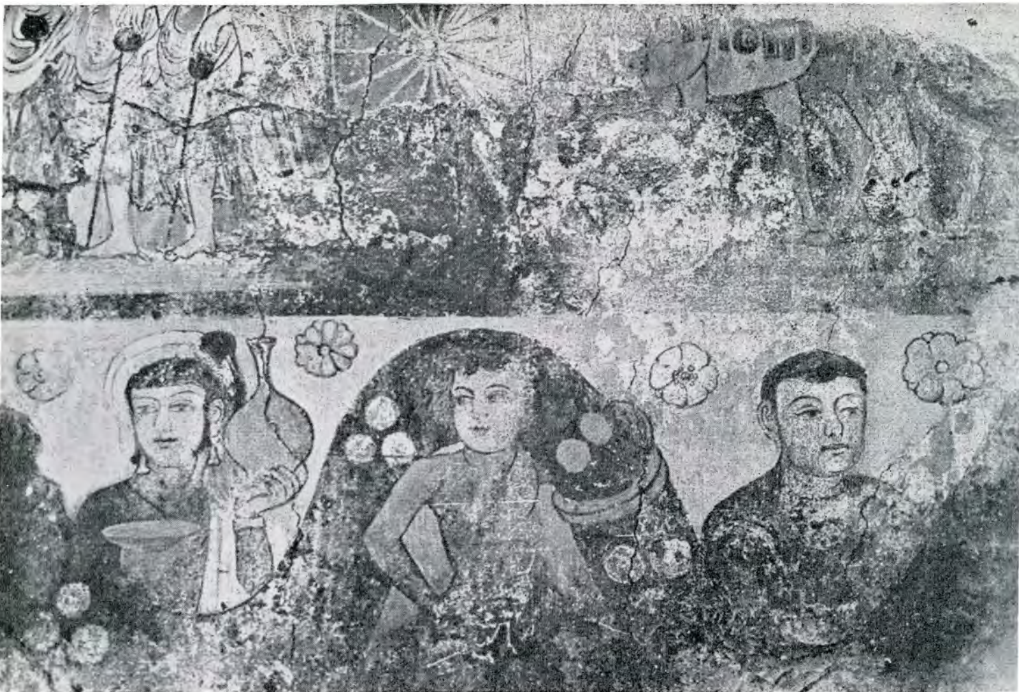
Fig. 12: Wall-painting from Miran, Central Asia, 3rd century, Museum of Central Asian Antiquities, New Delhi