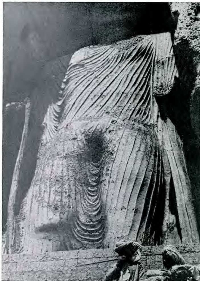
Fig. 5: Buddha (120'), 2nd-3rd century, Bamiyan, Afghanistan

Just as the statue of the deified Roman Emperor may have influenced the anthropomorphic representation of Buddha, so the classical cult of the colossal that began to manifest itself in the giant effigies of Nero and Constantine certainly has a reflection in the giant images of Bāmiyān in Afghanistan. These two colossal statues, respectively 120 and 175 feet high, were carved out of the sandstone cliff and covered with a heavy layer of mud and plaster originally painted and gilded. The 120-foot colossus is an enlargement of a typical Gandhāra Buddha of the 2nd century A.D. (fig. 5) The larger 175-foot statue, with its drapery arranged in string-