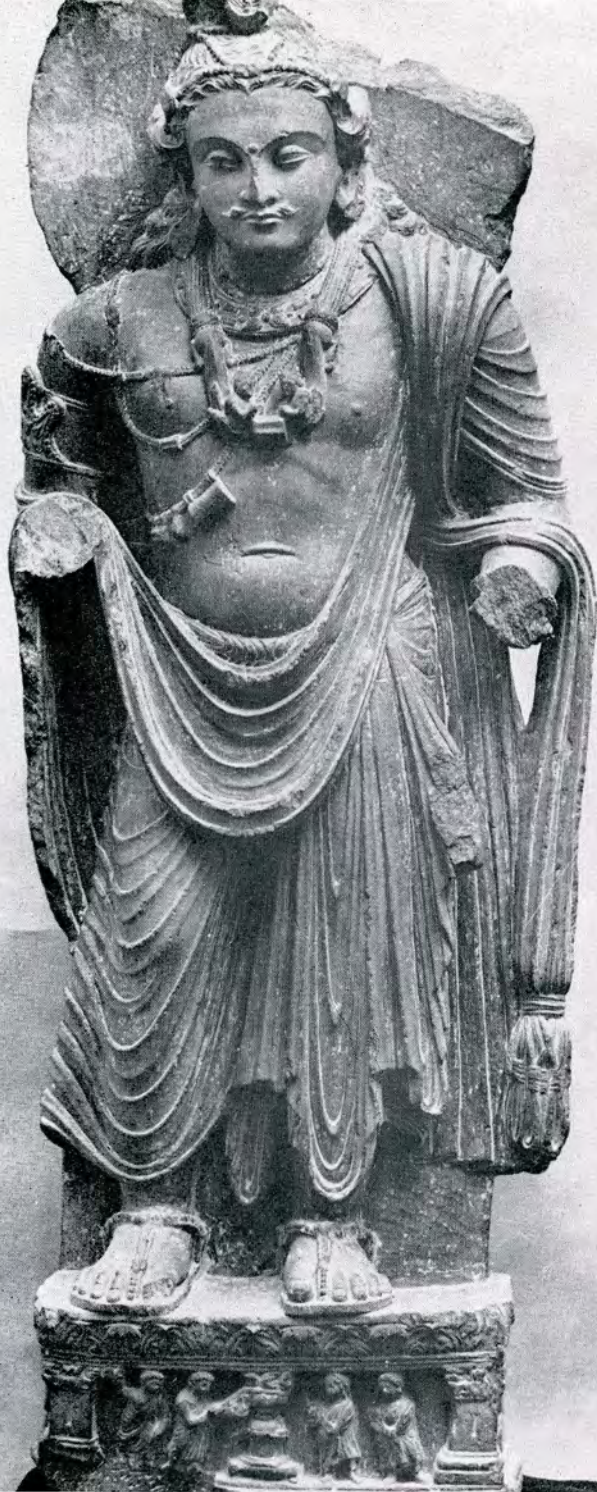
Bodhisattva, 2nd century schist, 40 \frac{1}{8} x 15 Lahore, Central Museum