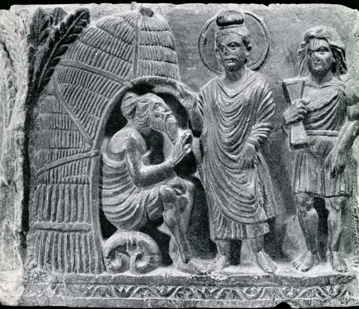
"Sakyamuni's First Meeting with a Brahmin", late 1st century, fine-grained schist, 15½ x 19½, Peshawar Museum