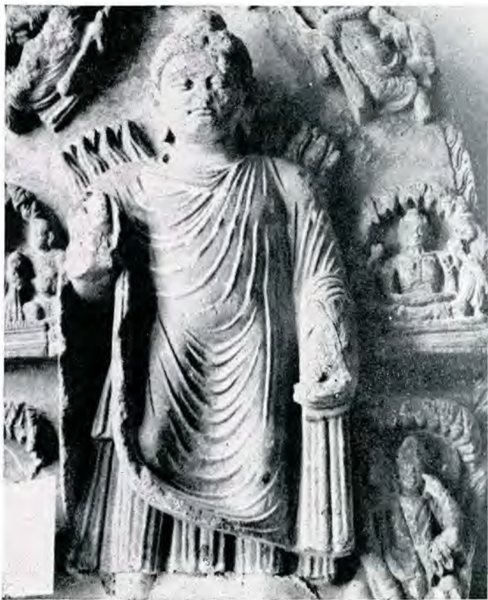
Fig. 4: "Buddha of the Great Miracle", from Begram, 3rd-4th century, Museum, Kabul, Afghanistan

In even later examples, such as the Buddhas from the Begram region in Afghanistan, the robe is only schematically symbolized by a series of stringlike loops descending down the median line of the body. (fig. 4) The representation of