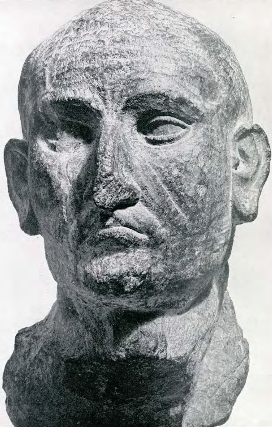
Portrait of a Donor, 2nd-3rd century schist, 11\frac{1}{2} \times 7\frac{1}{8} . Peshawar Museum