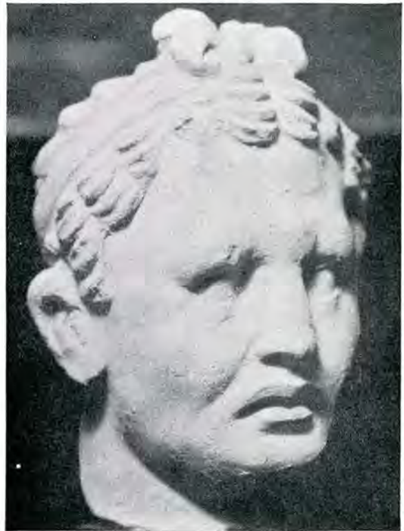
Fig. 10: Head, 2nd-3rd century, stucco, The Nelson Gallery-Atkins Museum, Kansas City

The types of Gandhāra stucco sculpture reflect Hellenistic and Roman precedents just as closely as their counterparts in stone (fig. 10)