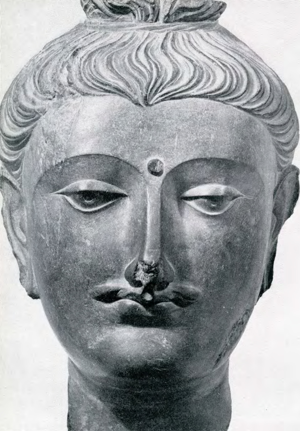
Colossal head of Buddha from Sikri, 2nd century schist, height: 16" Lahore, Central Museum