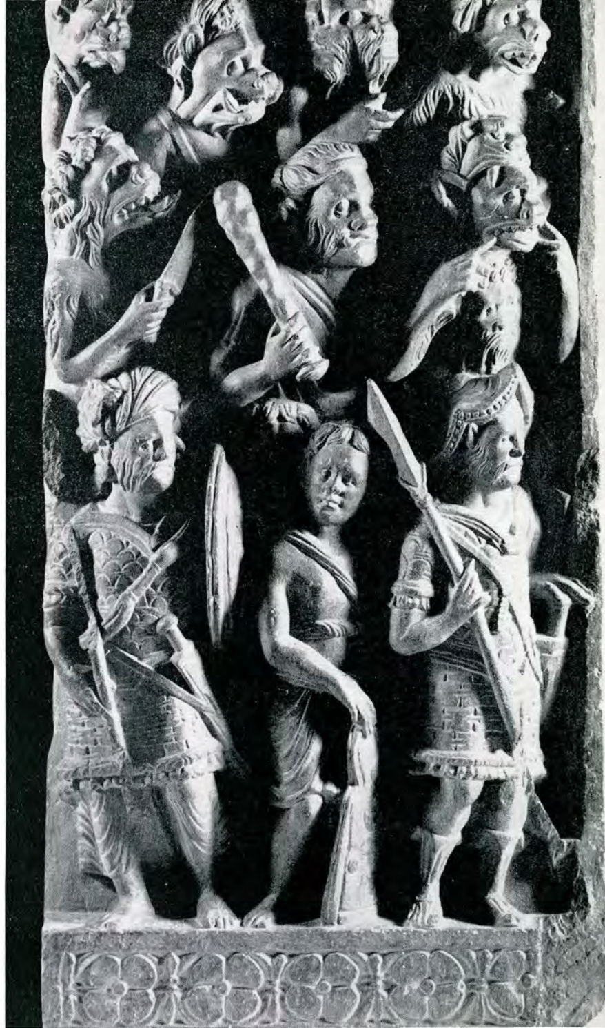
"The Host of Mara", 2nd century, fine-grained schist, 22 \frac{3}{8} x 10 \frac{1}{8} , Lahore, Central Museum