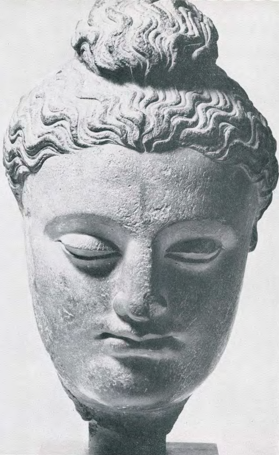
Head of Buddha 2nd century stone, height: 13" Peshawar Museum