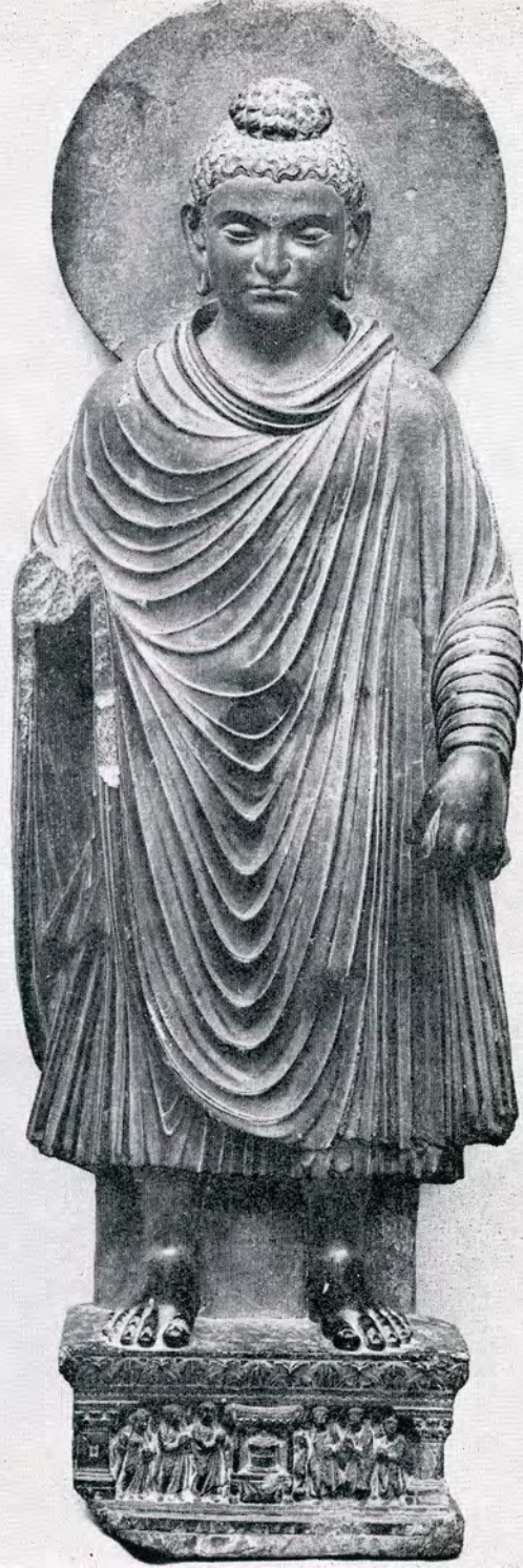
Standing Buddha 2nd century schist, height: 55½" Lahore, Central Museum