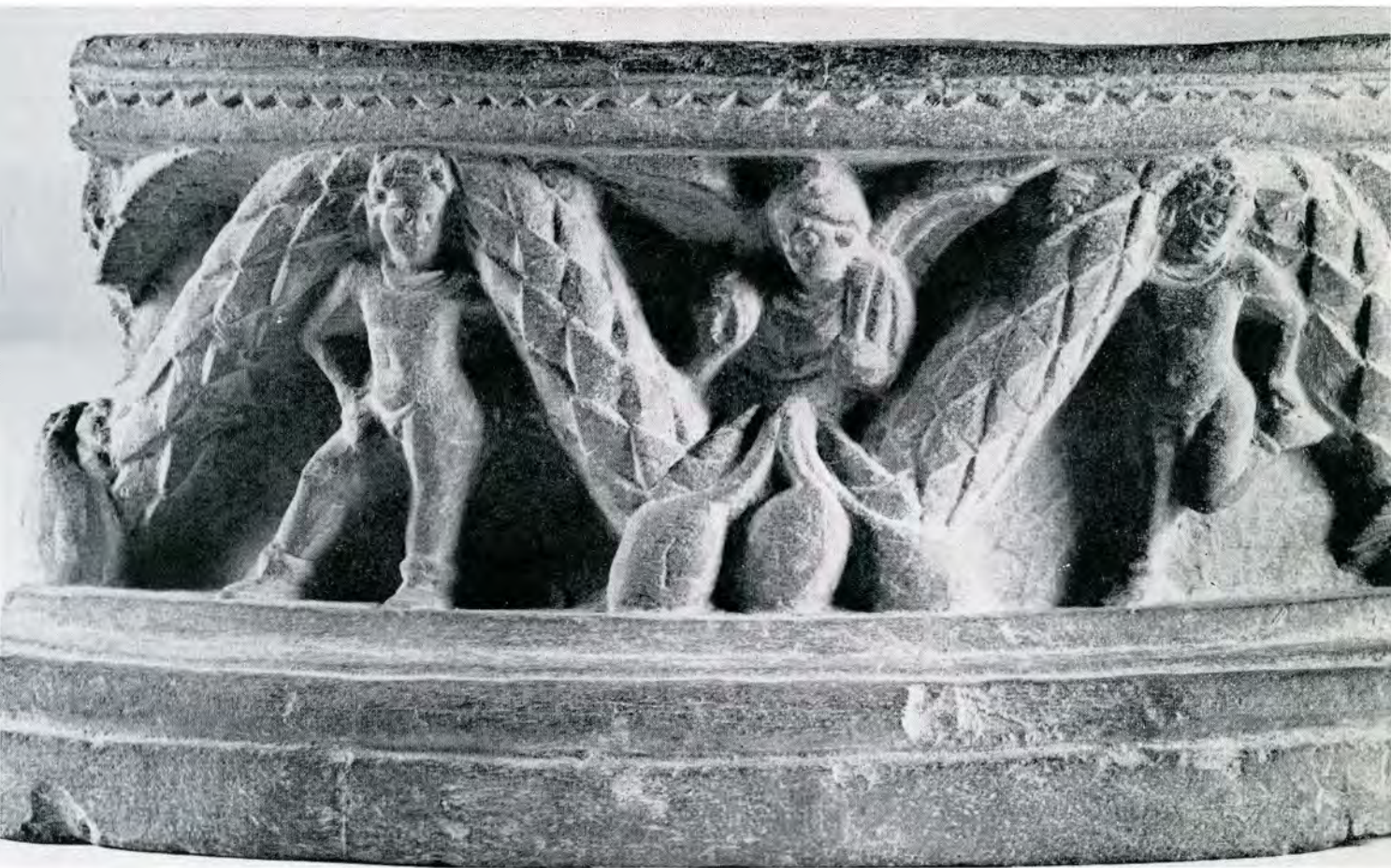
Fragment of a Frieze with Garland-bearing Putti, 2nd century, from Charsada, schist, h: 6½", Lahore, Central Museum