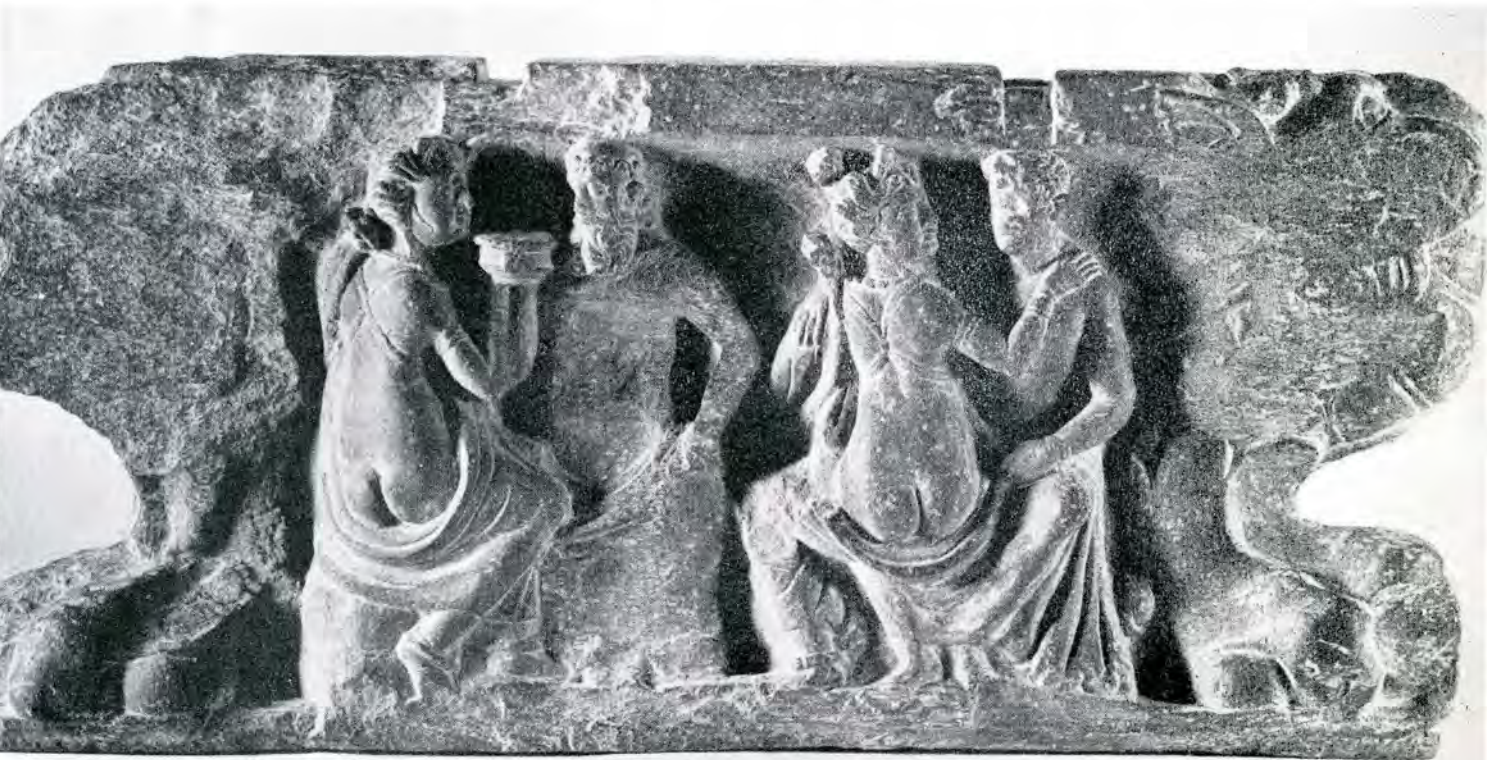
Bacchanal, 2nd century, schist, 9 \frac{7}{8} x 20 \frac{1}{2} , Lahore, Central Museum

The most famous example of the import of pagan types is the so-called Pallas Athena of Lahore (page 10) which may perhaps with even more likelihood be identified as the deified Rome: the goddess Roma appears on the coins of the Kushan emperor Huvishka 27 and her