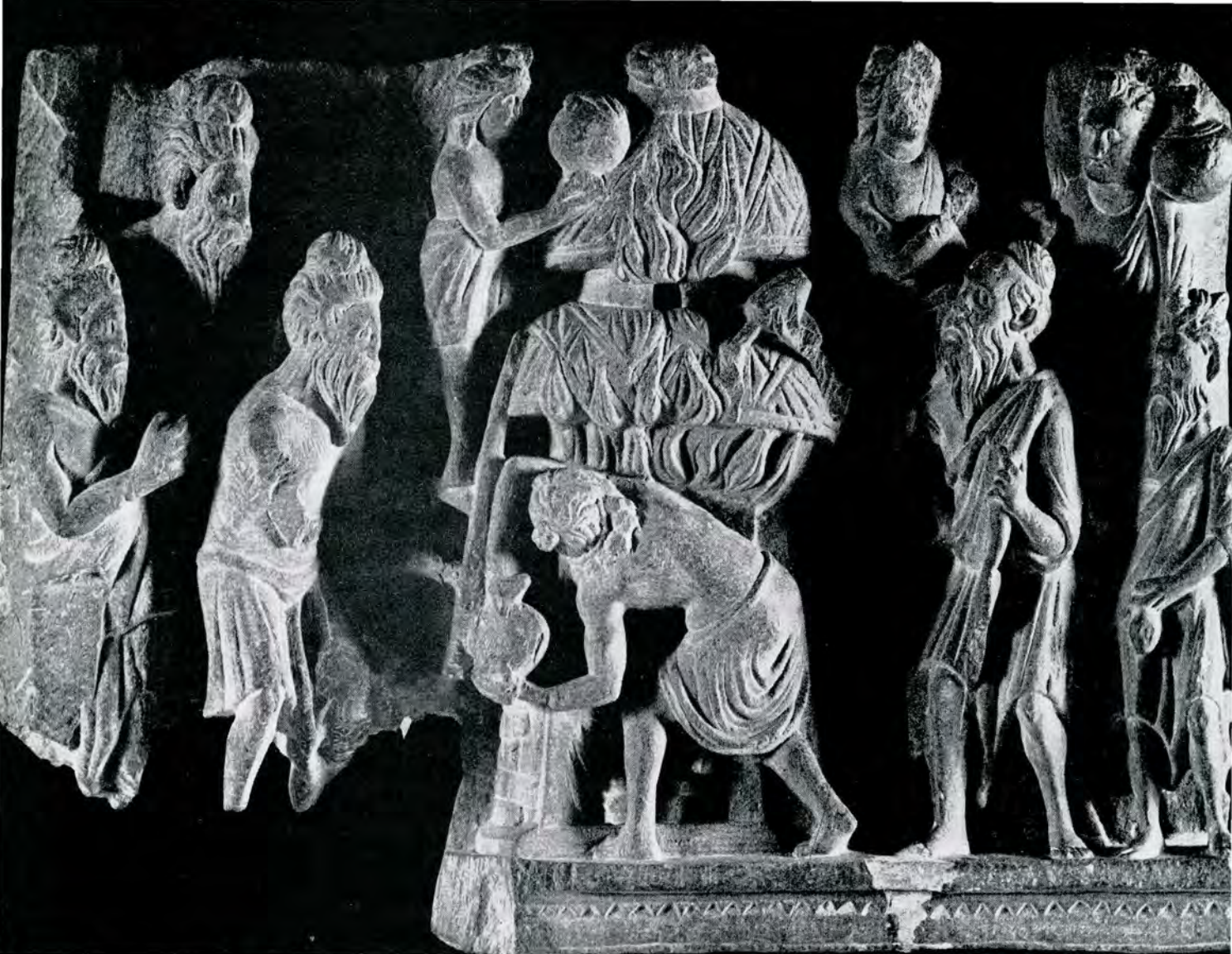
"The Ascetics of the Kasyapa Tribe endeavor to extinguish the conflagration in the Fire-Temple", 3rd century, schist, 23½ x 15¾, Lahore, Central Museum