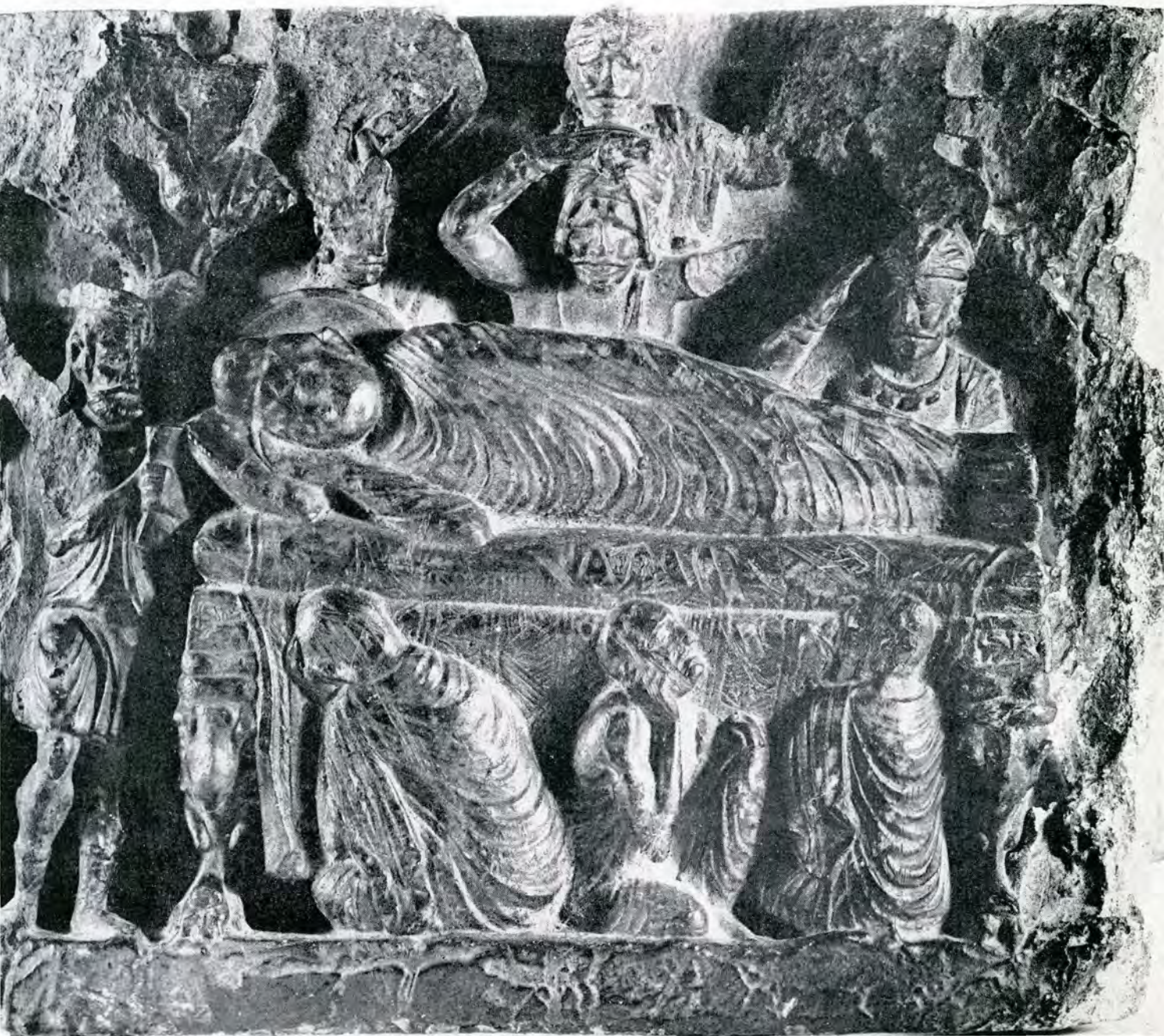
The Nirvana, 2nd century, schist, 10½ x 13½, Peshawar Museum