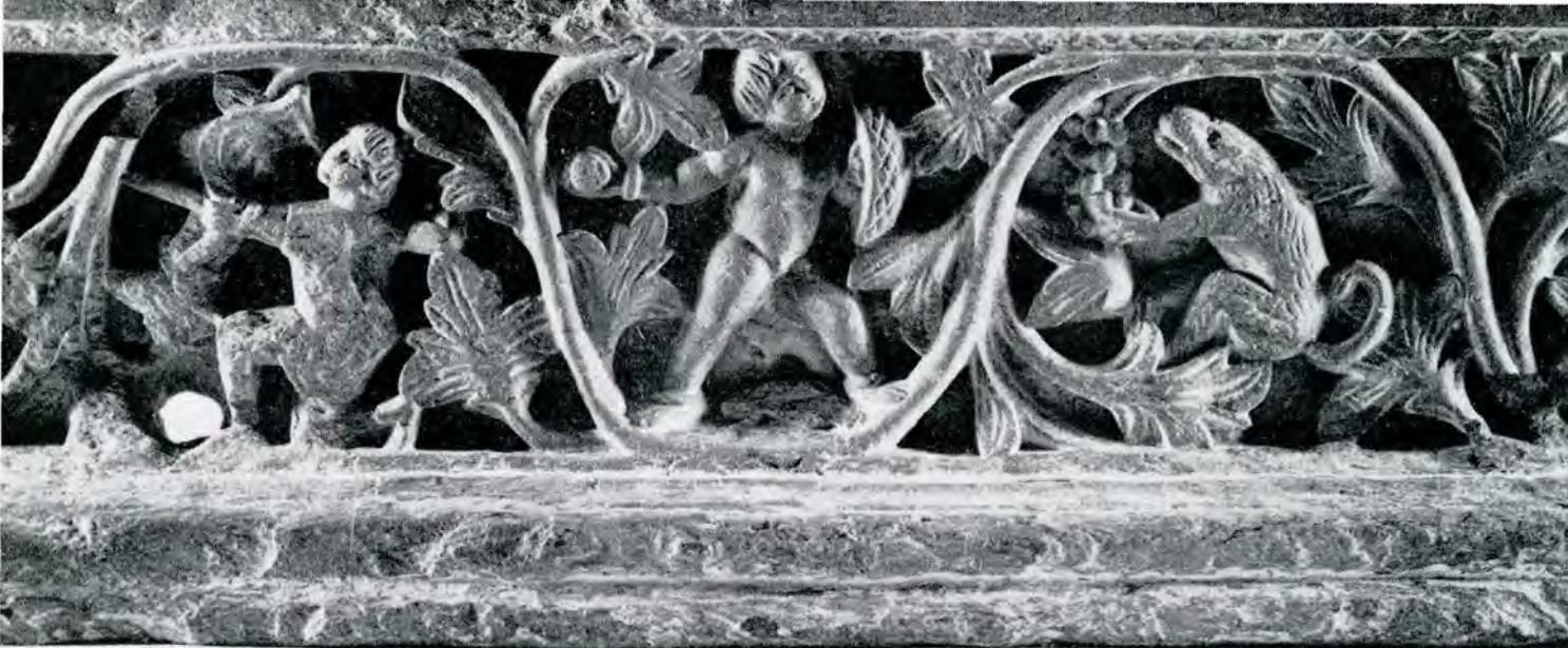
Frieze, with inhabited grapevine pattern, 2nd-3rd century, schist, height: 7", Peshawar Museum

and craftsmen, the latest style presumably made its appearance towards the close of the 2nd century A.D.