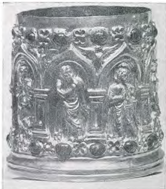
Fig. 8: Reliquary from Bīmarān, 2nd-3rd century, British Museum, Calcutta

Important for any discussion of Gandhāra sculpture is the famous reliquary of Bīmarān in the British Museum. This gold circular box studded with rubies was found in 1840 by Charles Masson in a stupa at Bīmarān in Afghanistan. (fig. 8) The fact that coins of the Śaka king Azes were found associated with the casket has led some scholars to attribute this object to the 1st century B.C. But actually the coins could have been inserted at any time subse-