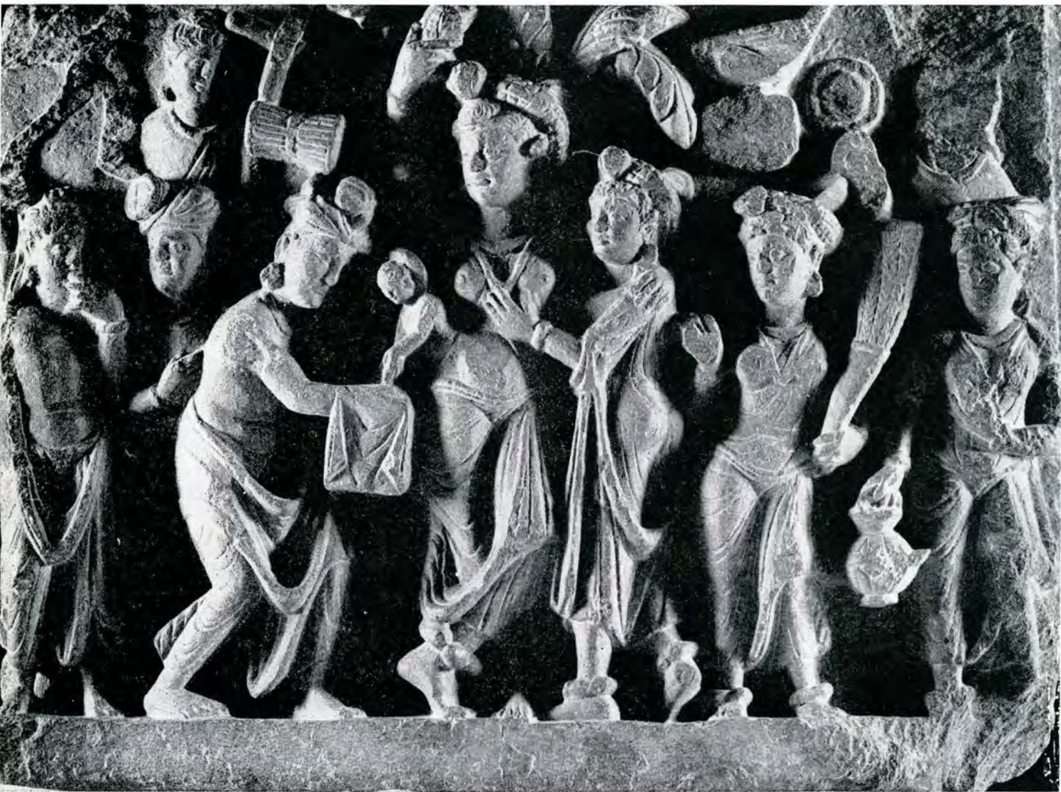
"Birth of Siddhartha", 2nd century, schist, 13 \frac{3}{8} x 17 \frac{3}{4} , Lahore, Central Museum