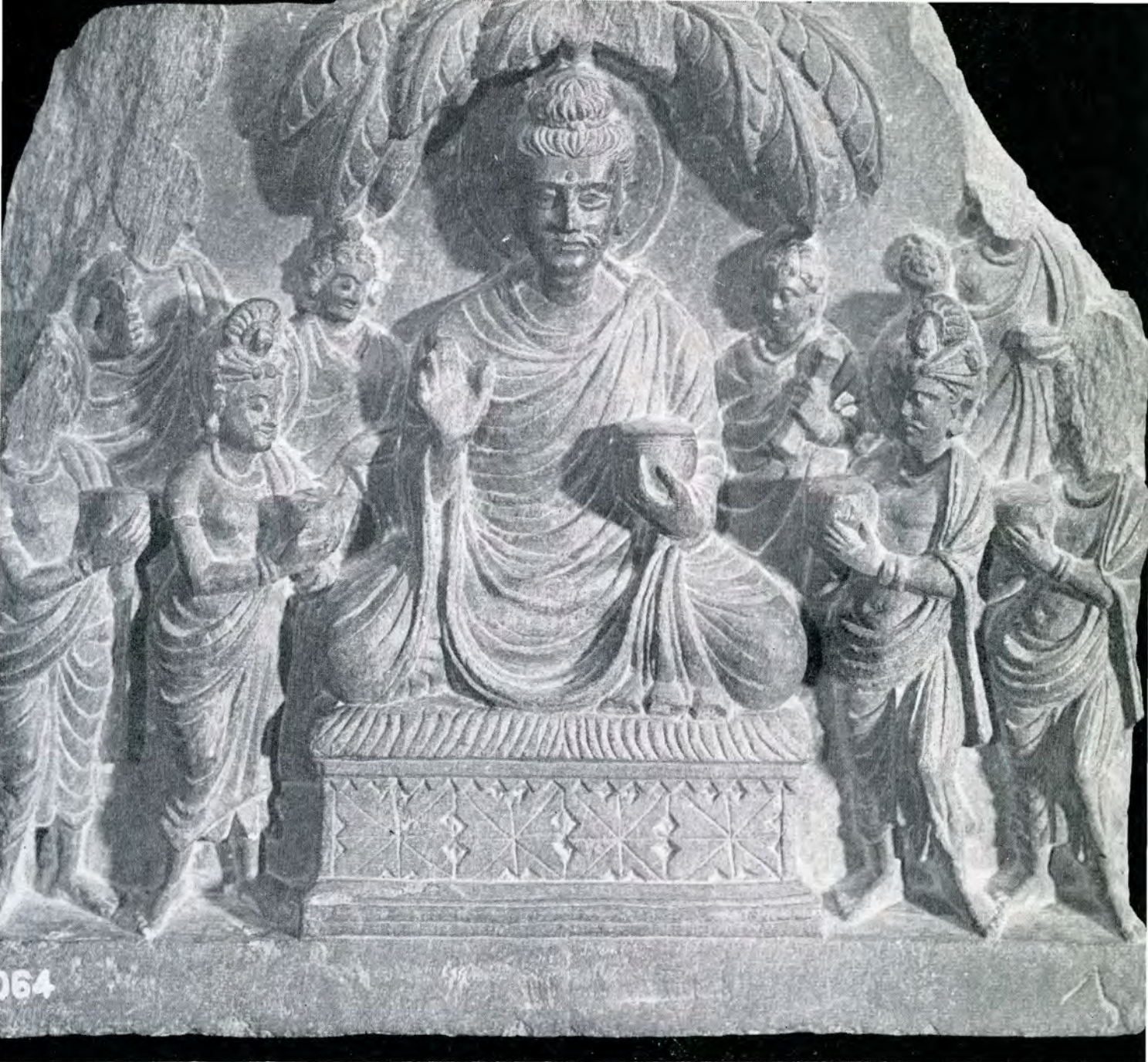
"The Offering of the Four Bowls", early 2nd century, schist, 9 \frac{1}{8} x 10 \frac{3}{8} , Lahore, Central Museum