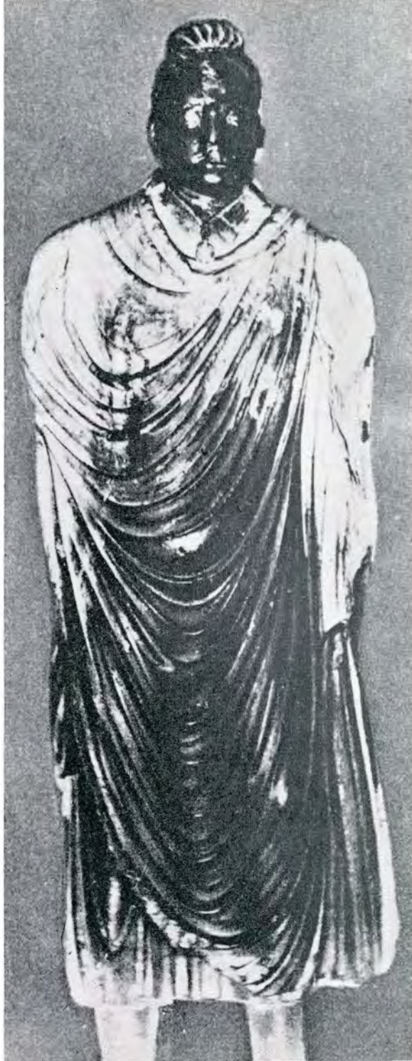
Fig. 7b: Buddha, from Charsada, Hashtnagar, Pakistan