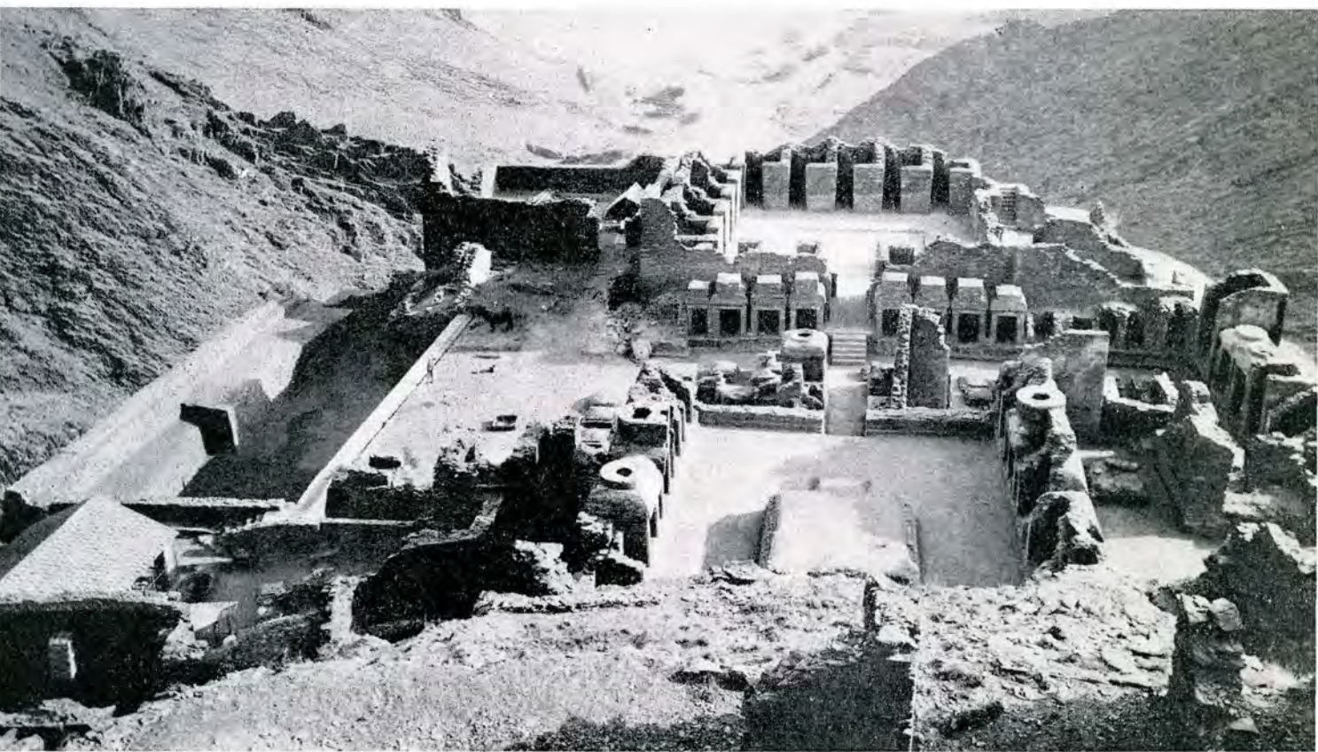
Fig. 2: Monastery of Takht-i-Behi near Peshawar, Pakistan

under the direction of the famous archaeologist, Sir John Marshall. These pieces (page 46) come from the Parthian and Early Kushan strata, so that according to Sir John Marshall's chronology it is possible to date them in the 1st and early 2nd centuries A.D. A few other objects, notably the beautiful head of a Bodhisattva (page 47), were unearthed at Chārsada nearly 60 years ago. This famous site near Peshawar, which has been the object of recent excavations directed by Sir Mortimer Wheeler, 4 was the ancient Pushkalāvati, besieged by Alexander in 327 B.C. and