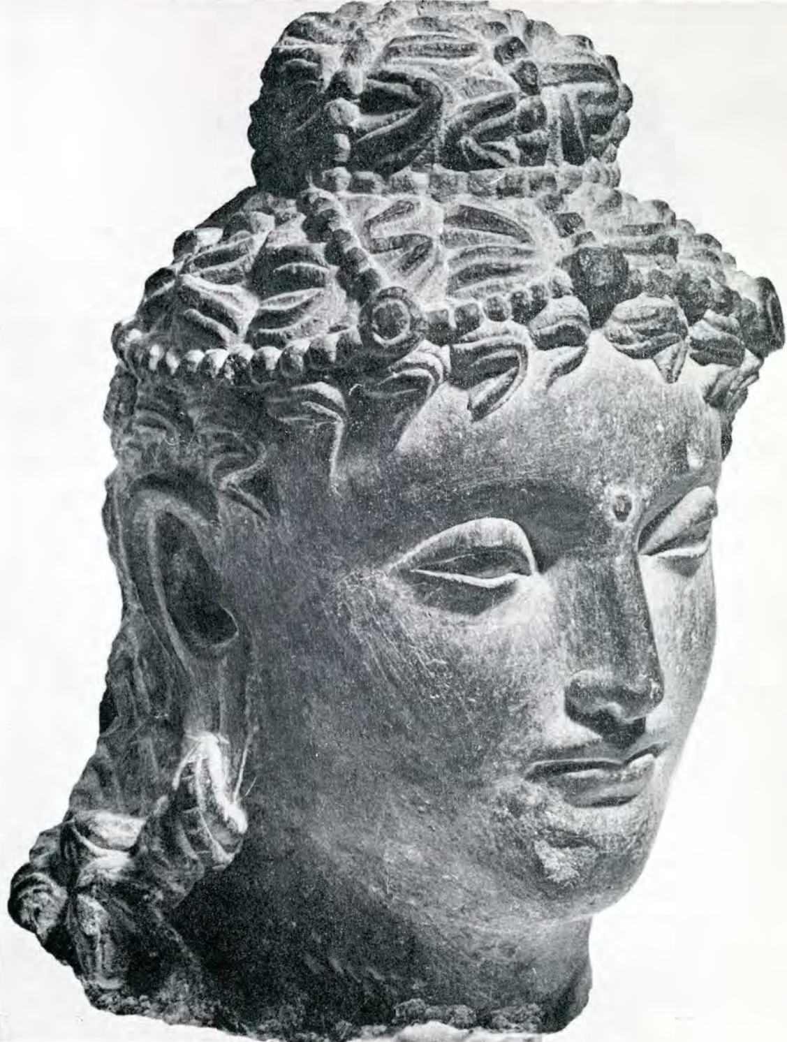
Head of a Bodhisattva early 2nd century from Charsada fine-grained schist height: 5-15/16" Peshawar Museum