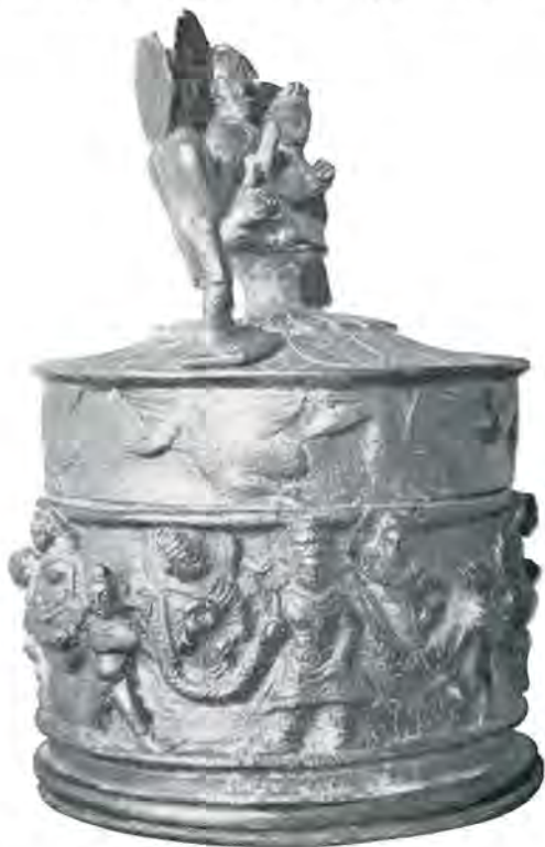
Fig. 9: Reliquary of King Kanishka, late 2nd century, Peshawar Museum

No less famous is the reliquary of Kanishka, found in the ruins of the famous stupa-pagoda erected by that monarch at the site of Shāh-jī-kī-dherī near Peshawar. (fig. 9) 16 The Kanishka reliquary is a metal box in the shape of a pyxis surmounted by freestanding figures of the Buddha and two Bodhisattvas on lotuses mounted on the lid. Around the side of the lid and the drum of the box are two zones of ornament comprising hamsa and erotes carrying a garland. On one side of the box appears the statue of the divinized Kanishka flanked by the sun and moon. There is also a very mutilated inscription, sometimes translated as referring to the first year of Kanishka's reign. More certain