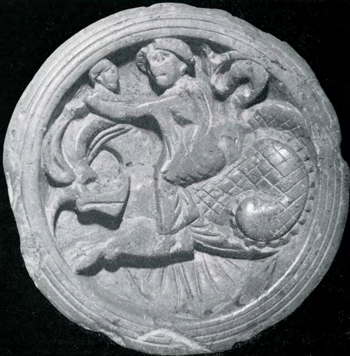
Toilet Tray, 1st century, from Sirkap, Taxila, schist, diameter: 3½", Karachi, National Museum