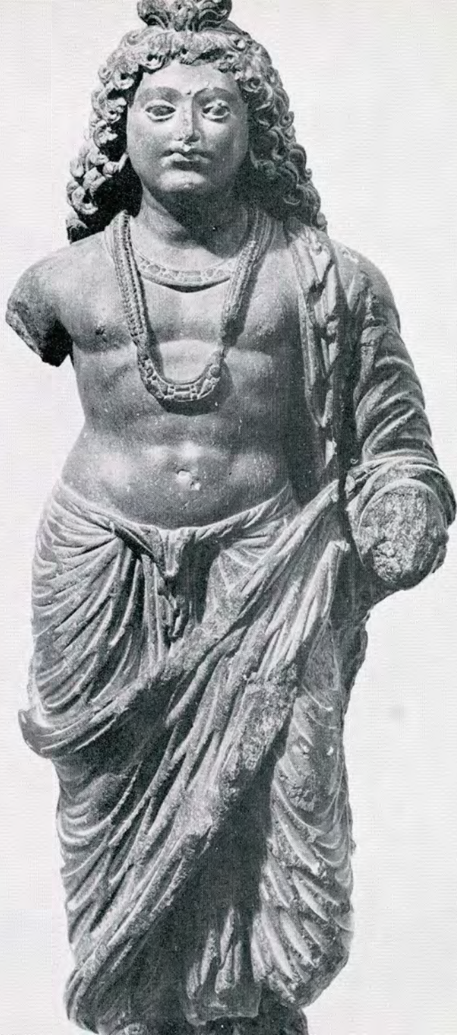
Statuette of a Bodhisattva, perhaps Siddartha, 2nd-3rd century, schist 18 \frac{1}{8} x 7 \frac{1}{2} Lahore, Central Museum