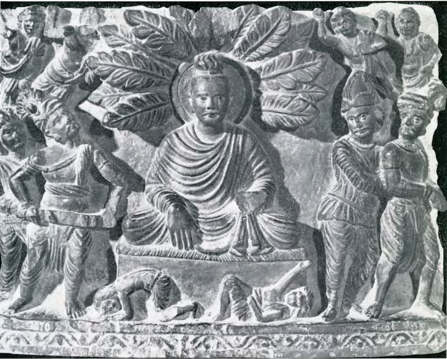
"The Temptation of Mara", late 1st century, schist, 15¼ x 20, Peshawar Museum