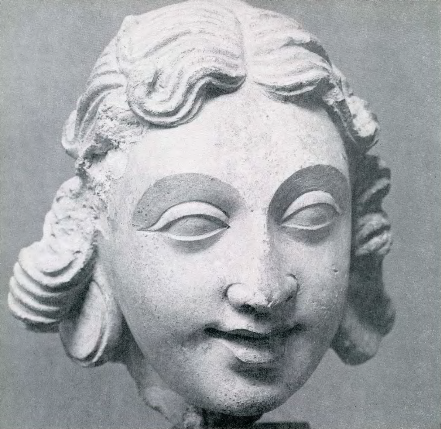
Fig. 11: Head of a Devata, 2nd-3rd century, stucco, height: 7", Museum of Fine Arts, Boston