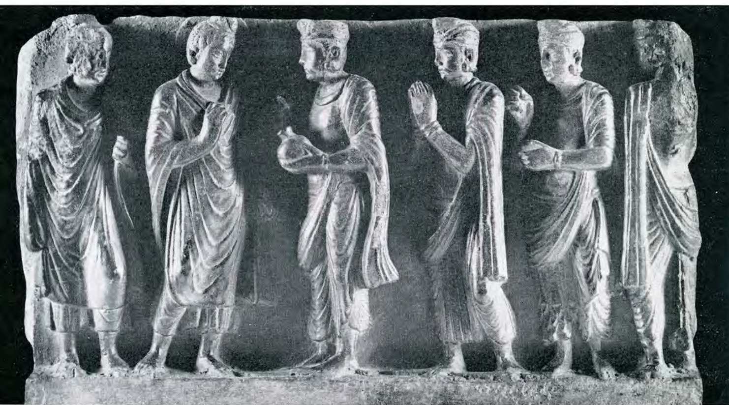
"Anathapindada presents the Jetavana Park to the Buddha", late 1st century, schist, 8 x 13 \frac{3}{8} , Peshawar Museum