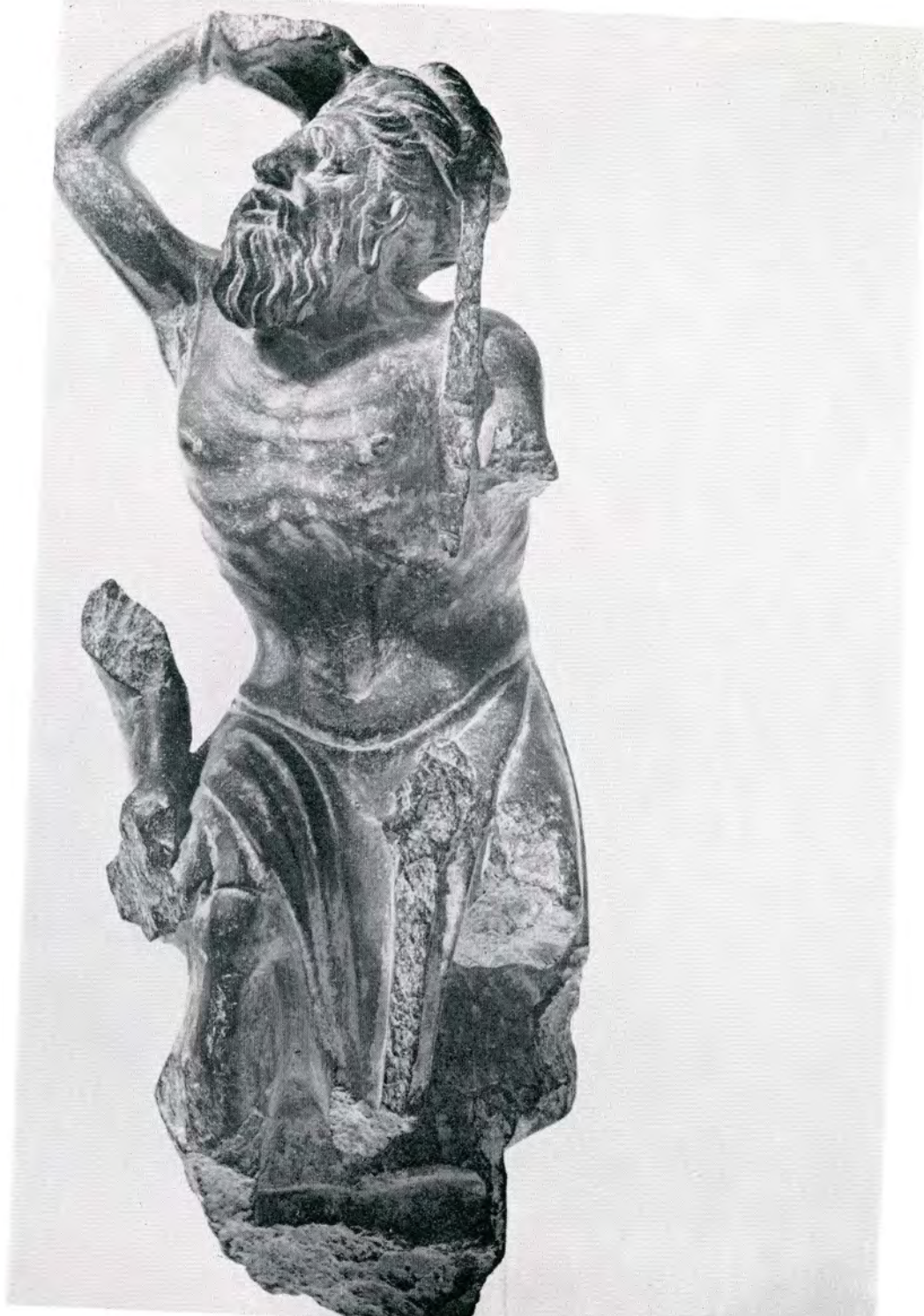
Ascetic, 2nd century schist, height: 10¼" Lahore, Central Museum