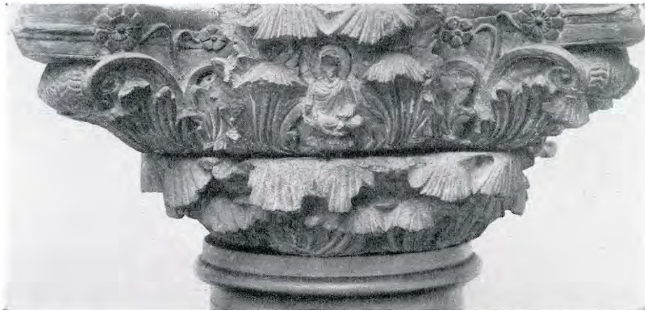
Fig. 13: Corinthian capital, 2nd-3rd century, gray slate, British Museum, London

The main mass of the Gandhāra stupa was generally a conglomerate of rubble and earth, over which was placed a facing of roughly shaped stones with many small courses of stones