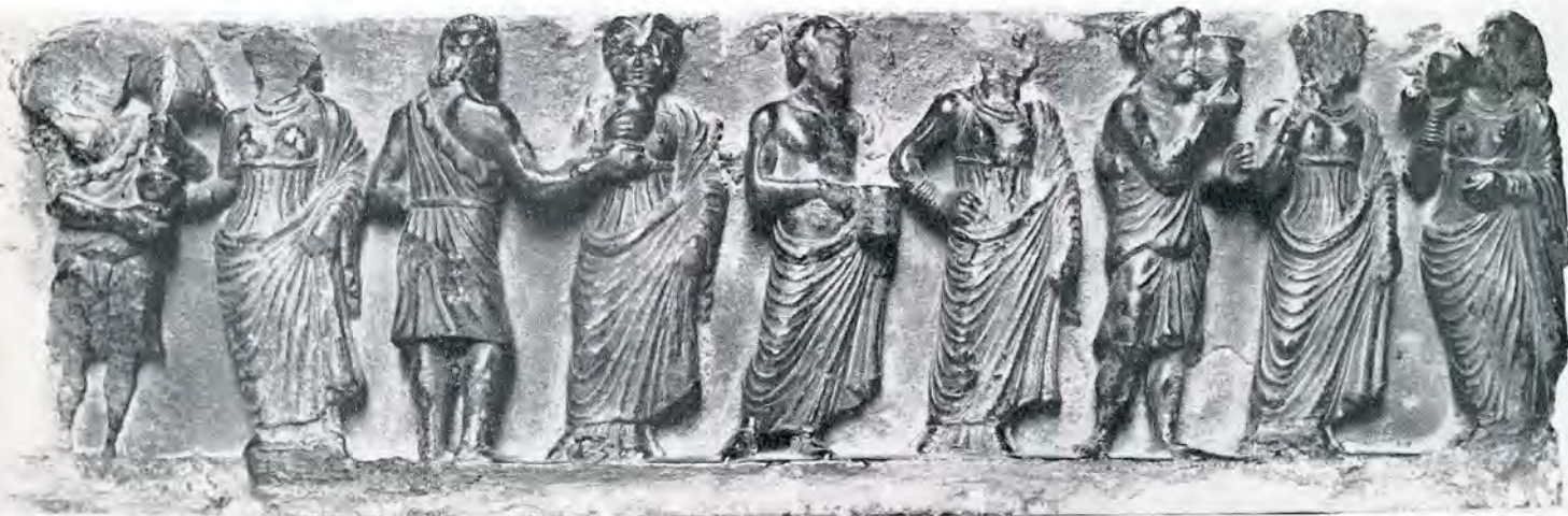
Group of Donors, (stair-riser), 1st century, from the Guide's Mess at Hoti Mardan, steatite, 5½ x 17½. Peshawar Museum