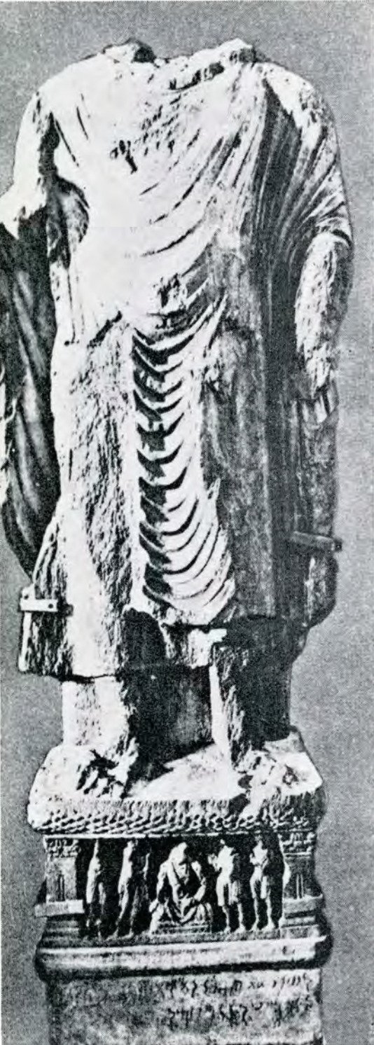
Fig. 7a: Buddha, from Lorian Tangai, Indian Museum, Calcutta