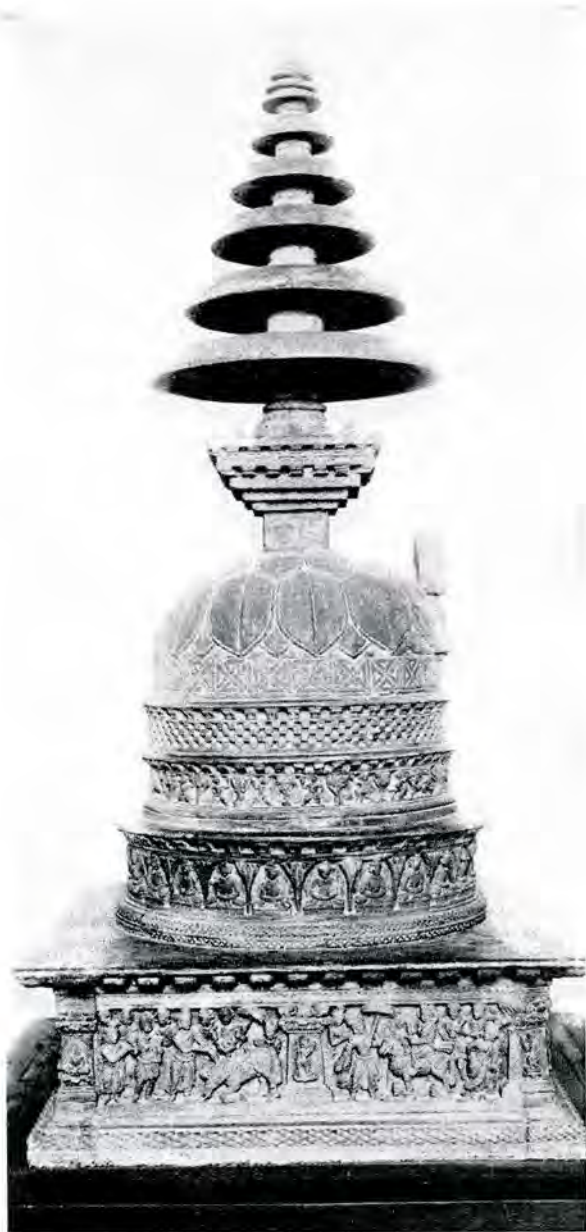
Fig. 14: Miniature Stupa, from Loriyan Tangai, 2nd-3rd century, slate, Indian Museum, Calcutta

or sneeks filling the interstices between these boulders. The relics were embedded in the mass of the building, sometimes in the deepest foundations and sometimes in a chamber on a level with the drum. The Gandhāra stupa differs from its early Indian precedents in that the decoration has been transferred from the railing and toranas to the body of the monument itself. The base and drum of the Gandhāra stupa were completely encased in a sculptural revetment carried out in stucco or lime plaster. The decoration consisted of panels of scenes from the life of Buddha, separated by pilasters of a classical type, or in some of the later stupas figures of Buddhas and Bodhisattvas framed in the niches of a continuous arcade surrounding the body of the monument.