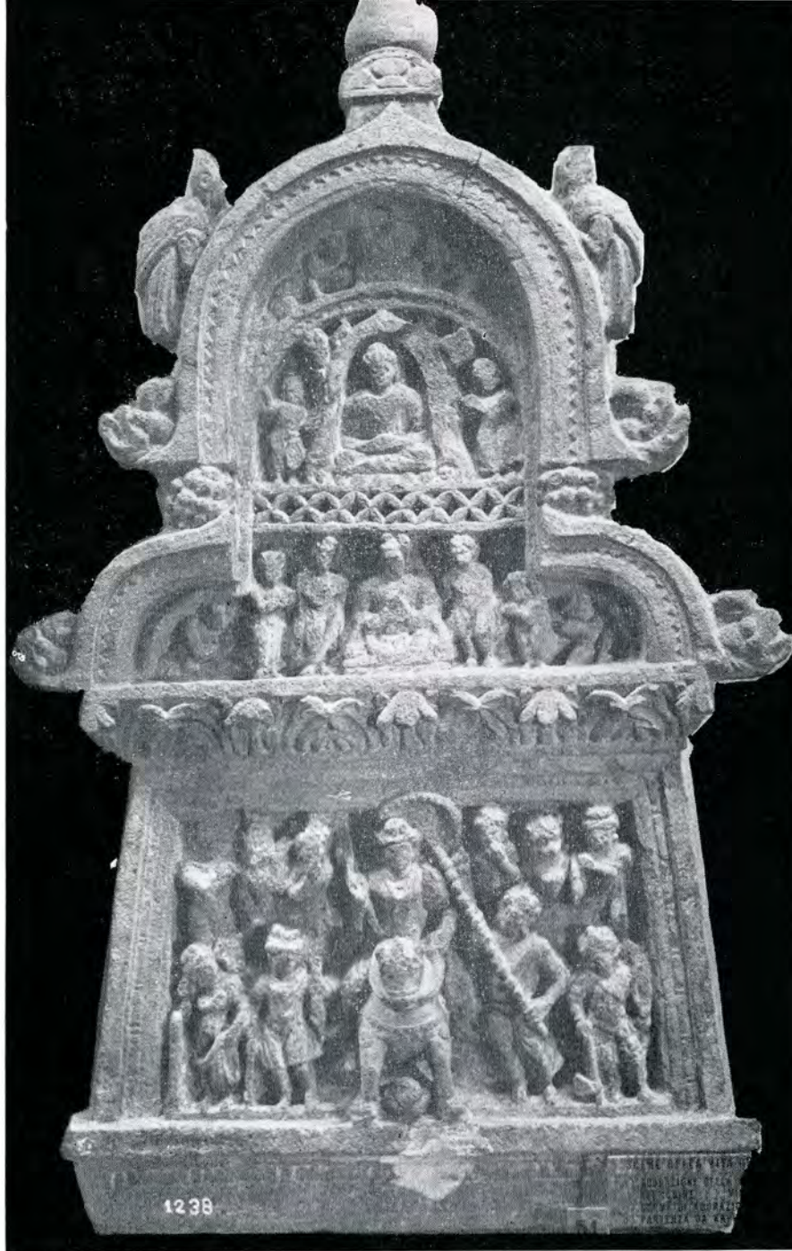
False gable, 2nd-3rd century, schist, 28½ x 16½, Lahore, Central Museum