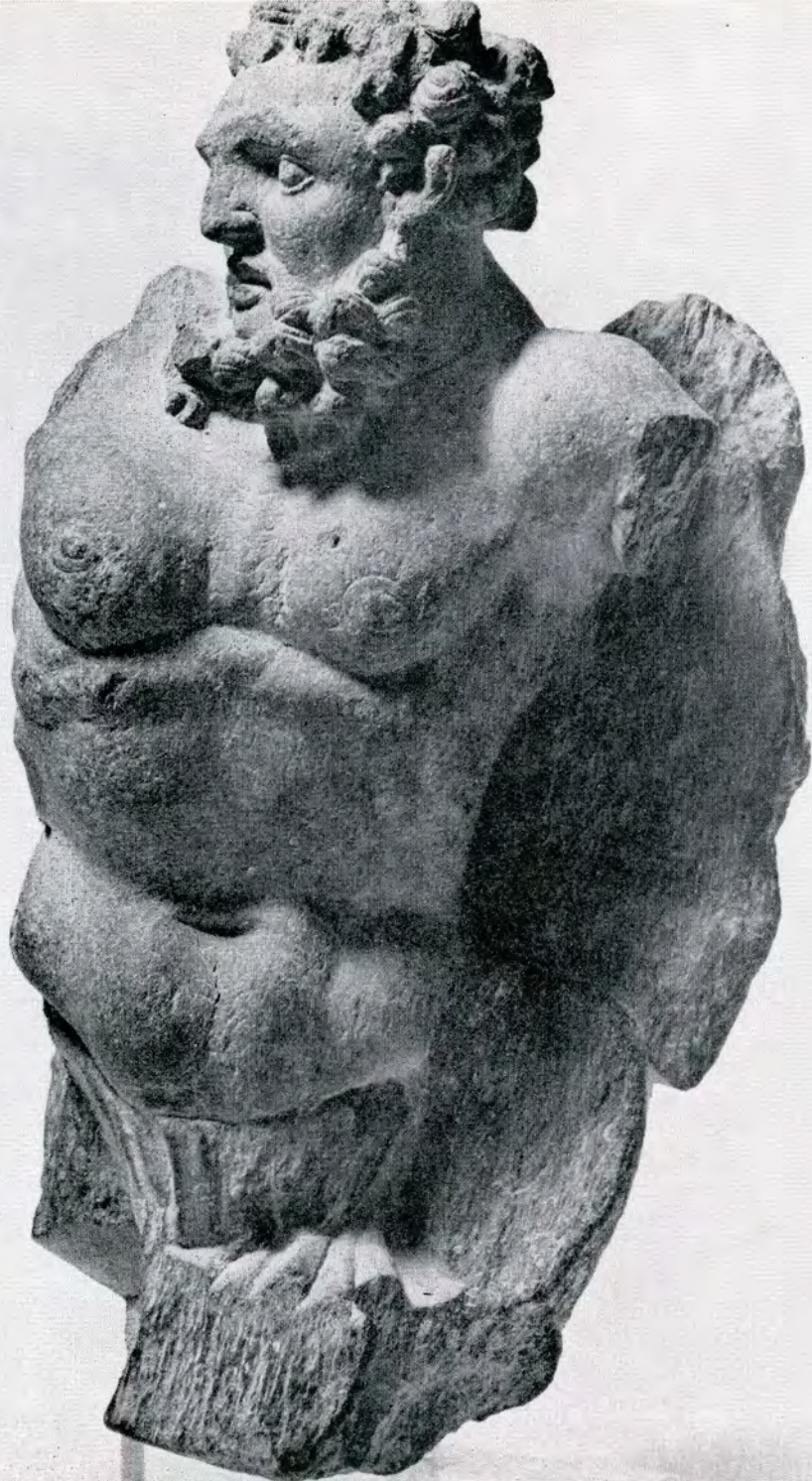
Torso of an Atlantid, from Sikri 2nd-3rd century, schist height: 9 1/8" Lahore, Central Museum