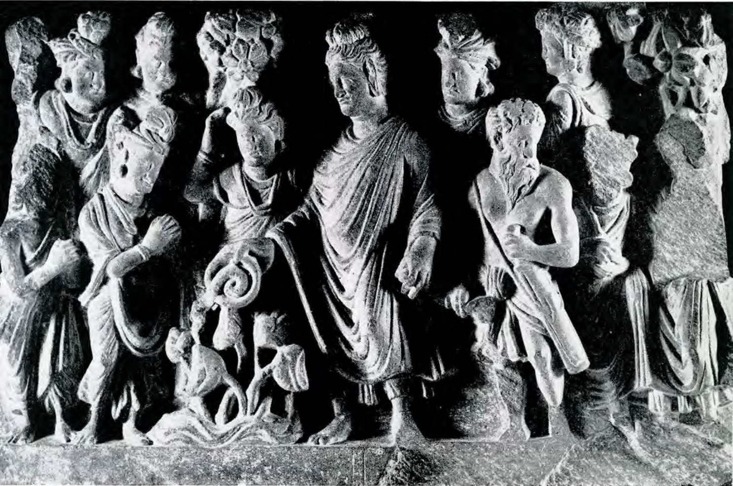
"Buddha and the Black Serpent of Rajagriha", 2nd century, schist, 12½ x 20½, Lahore, Central Museum

within a very few years. The Gandhāra parallels with Roman reliefs continue with the appearance of the deeply undercut illusionistic technique developed in Rome under the Antonines and Severids (ca. 138-217 A.D.) (page 28) if the very earliest of these styles reached Gandhāra in the last quarter of the 1st century A.D. through the intervention of Roman journeymen