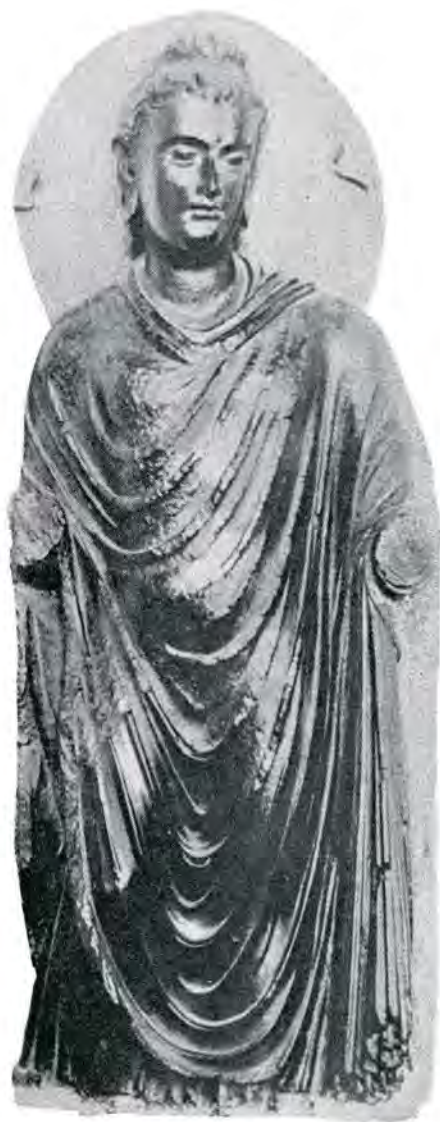
Fig. 3: Buddha, 1st century, (formerly in the Guides Mess, Hoti Mardan, Pakistan)

The standing Buddha image in Gandhāra is not so much an imitation as an adaptation of Western types and techniques by the Roman or Syrian artisans who were called upon to produce these icons. Typical of the very earliest type of Buddha image was a beautiful statue formerly at Hoti Mardan. (fig. 3) The head was apparently suggested by the youthful type of the Apollo Belvedere. The heavy, plastically conceived folds of the drapery, revealing the body, and yet existing as an independent volume, suggest the garments of Roman draped figures from the Claudian through the Flavian periods (ca. 40-100 A.D.) 10 Another early example is illustrated on page 13. The head, although somewhat more schematized than its classical prototype, seems again to derive from the type of the Apollo Belvedere. Such a relationship is also evident in the beautiful head from Chārsada (page 47), as well as in two other heads of Buddha (pages 48 and 49). 11 The drapery of the standing figure from Lahore (page 13) immediately suggests the toga of Roman imperial statues. The folds of the gar-