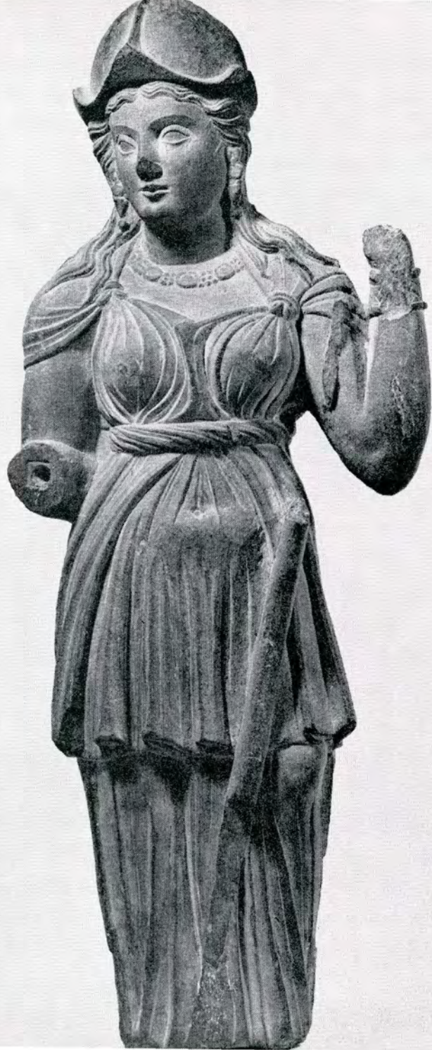
Athena, or Roma, 2nd century, fine-grained schist, height: 32 3/4" Lahore, Central Museum